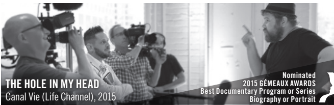
THE HOLE IN MY HEAD Canal Vie (Life Channel), 2015