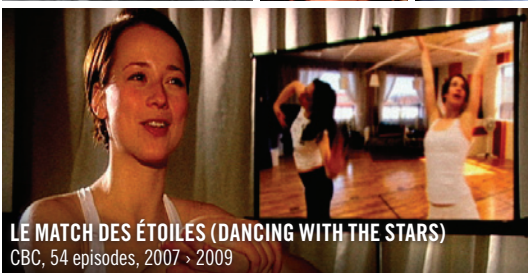
LE MATCH DES ÉTOILES (DANCING WITH THE STARS) CBC, 54 episodes, 2007 - 2009