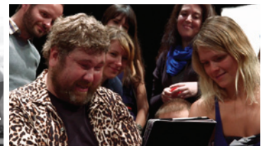
Nominated 2015 GÉMEUX AWARDS Best Documentary Program or Series Biography or Portrait