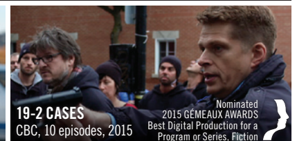
19-2 CASES CBC, 10 episodes, 2015 Nominated 2015 GÉMEUX AWARDS Best Digital Production for a Program or Series, Fiction