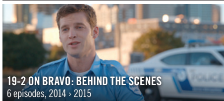
19-2 ON BRAVO: BEHIND THE SCENES 6 episodes, 2014 - 2015